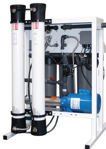
Titan 4000 200034